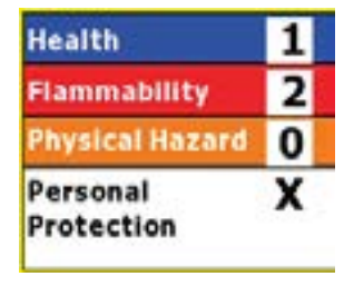
NFPA SCALE (0-4)